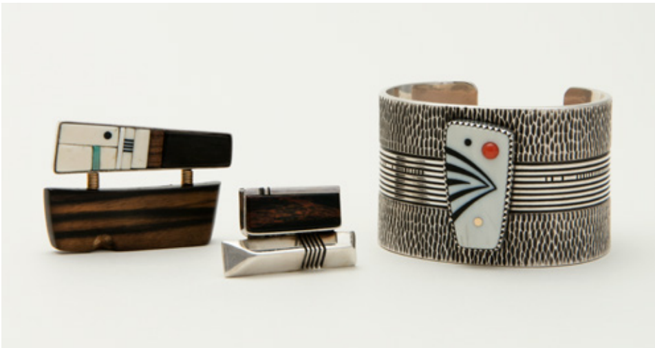
Left: Silver pin with wood, turquoise, and ivory; W 2 inches. Private collection.