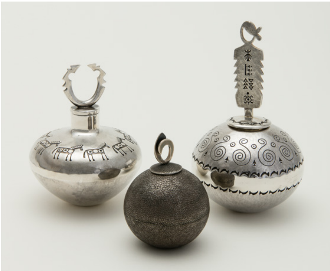
Left: Silver vessel with horses and horseshoe/figurative lid; H 3.5 inches. Private collection.