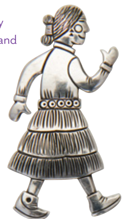
Silver pin depicting Norbert's mother, c.1999; H 2.75 inches. Collection of the Peshlakai family.