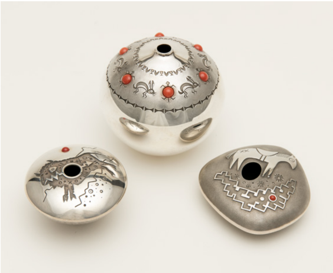
Bottom left: The Buffalo , silver seed pot with coral, 1994; D 3.2 inches. Collection of the Heard Museum, Phoenix, Arizona, Gift of Norman L. Sandfield.