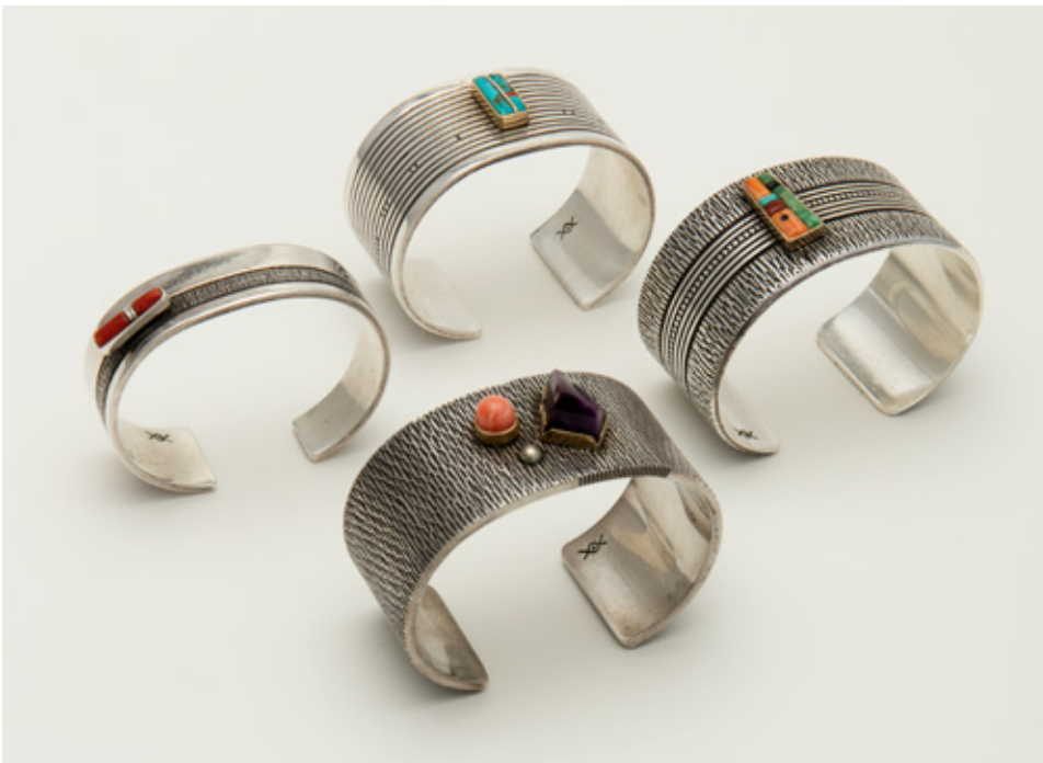
Left: Silver bracelet with coral; outside diameter 2.25 inches. Collection of Stephen Schultz.