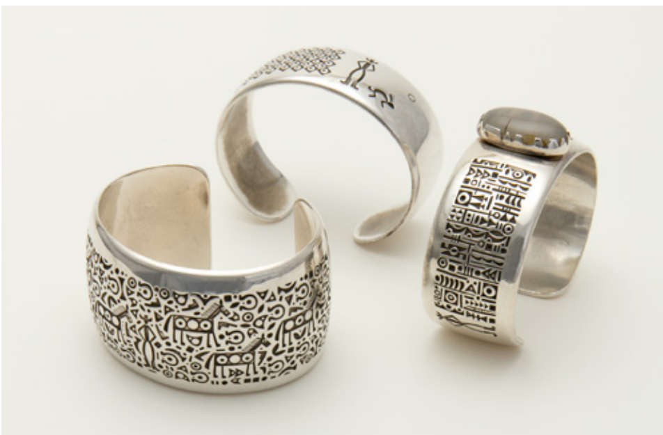
Left: Silver cuff with Cowboy Slim, horses, and horseshoes; outside diameter 2.5 inches. Collection of Carol Franco.