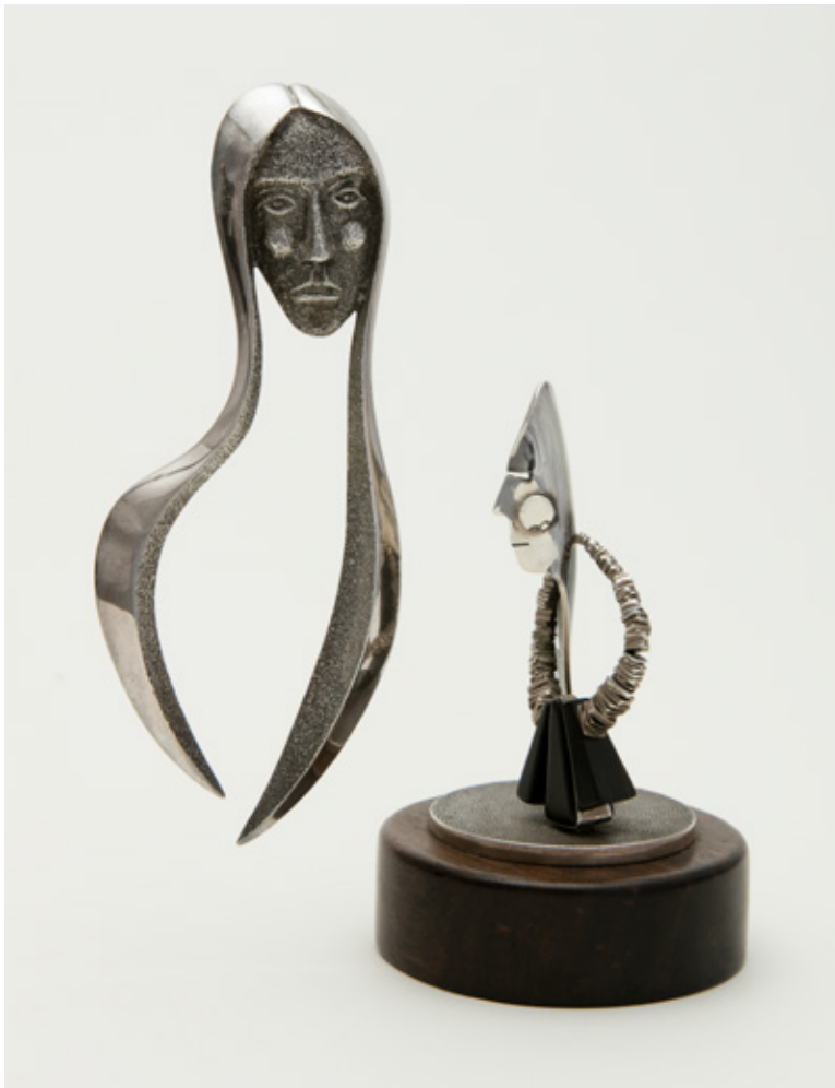
Left: Woman with Long Hair , silver sculpture, 1977; L 6 inches. Collection of Louann Van Zelst.