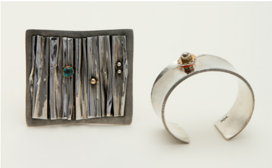
Left: The Curtain , silver pin and pendant with gold and turquoise, c. 2002; W 2.75 inches. Private collection.