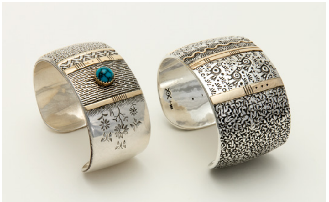
Left: Silver and gold cuff with turquoise, c. 1999; outside diameter 2.5 inches. Collection of the Peshlakai family.