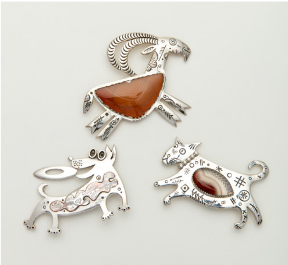
Left: Woof's Catch , silver and mokume gane pin, 2008; W 2.5 inches. Private collection.