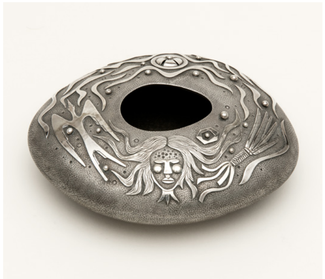
Above: Peyote Dream , silver seed pot, 1979; 4.75 x 4 inches. Private collection.

Tree Pot , 14 karat gold seed pot, c. 1984; D 1.5 inches. Collection of the Heard Museum, Phoenix, Arizona, Gift of Norman L. Sandfield.