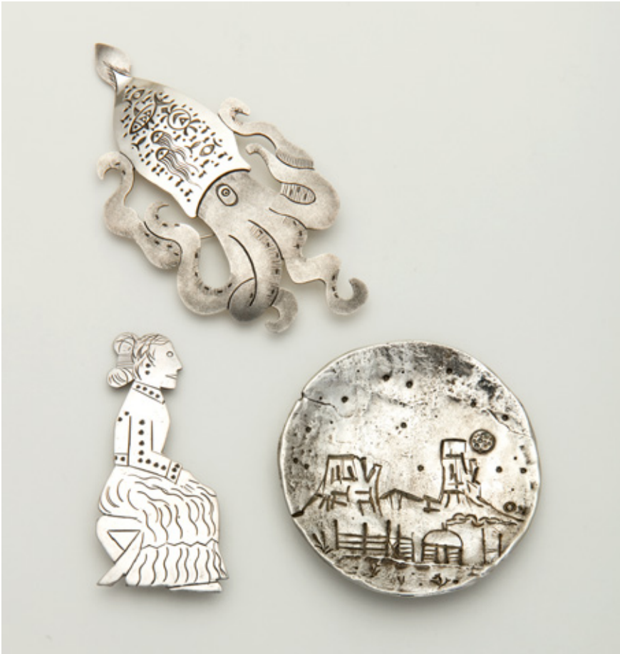
Top: Natasha Peshlakai-Haley, silver squid pin; 4 x 2 inches. Private collection.