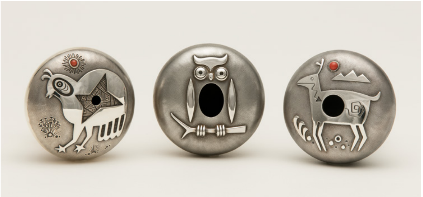
Left: Silver quail seed pot with coral, 2002; D 2.75 inches. Wheelwright Museum, Gift of Ruth and Sidney Schultz.