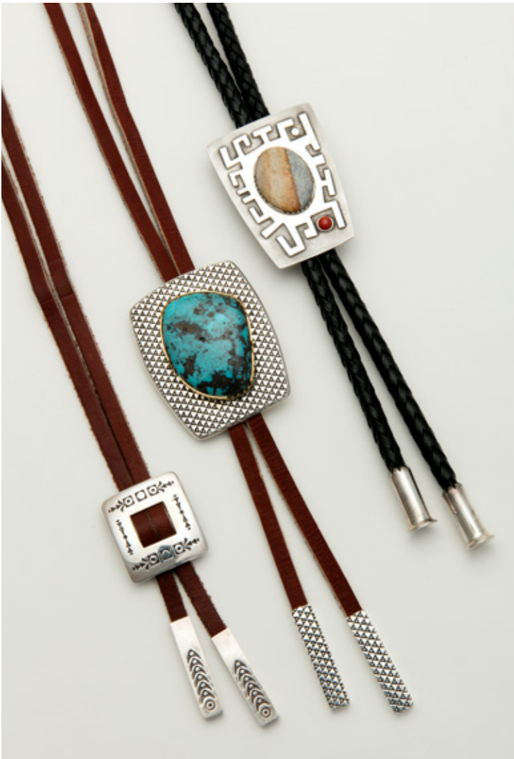
Left: Silver bolo tie, silver tips; ornament: 1.25 x 1.5 inches. Collection of the Peshlakai family.