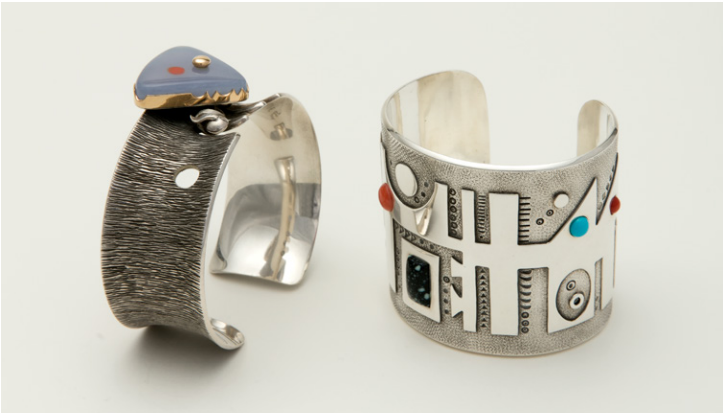
Left: Natasha Peshlakai-Haley, silver bracelet with 14 karat gold, chalcedony, and coral, c. 2010; outside diameter 2.6 inches. Private collection.