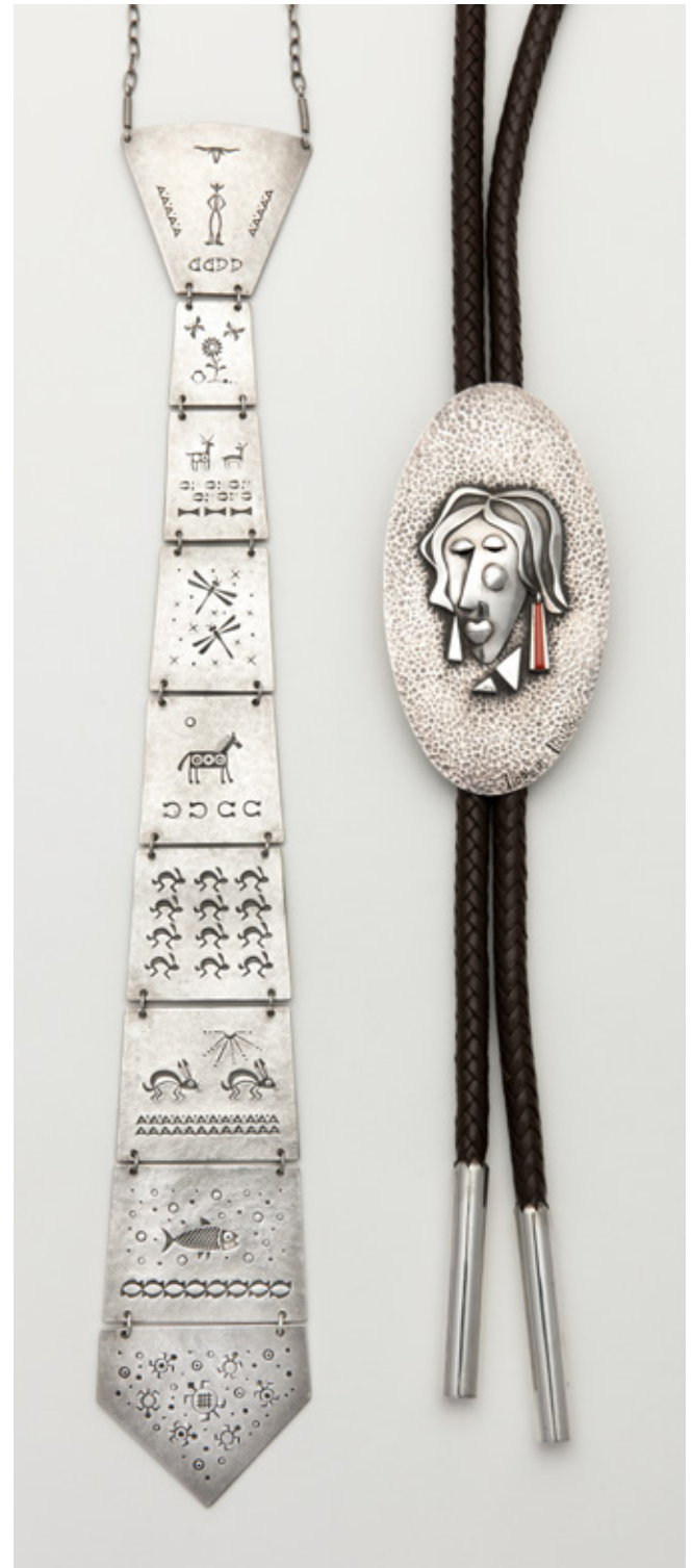
Left: Silver necktie, c. 1989; L 14 inches. Private collection.