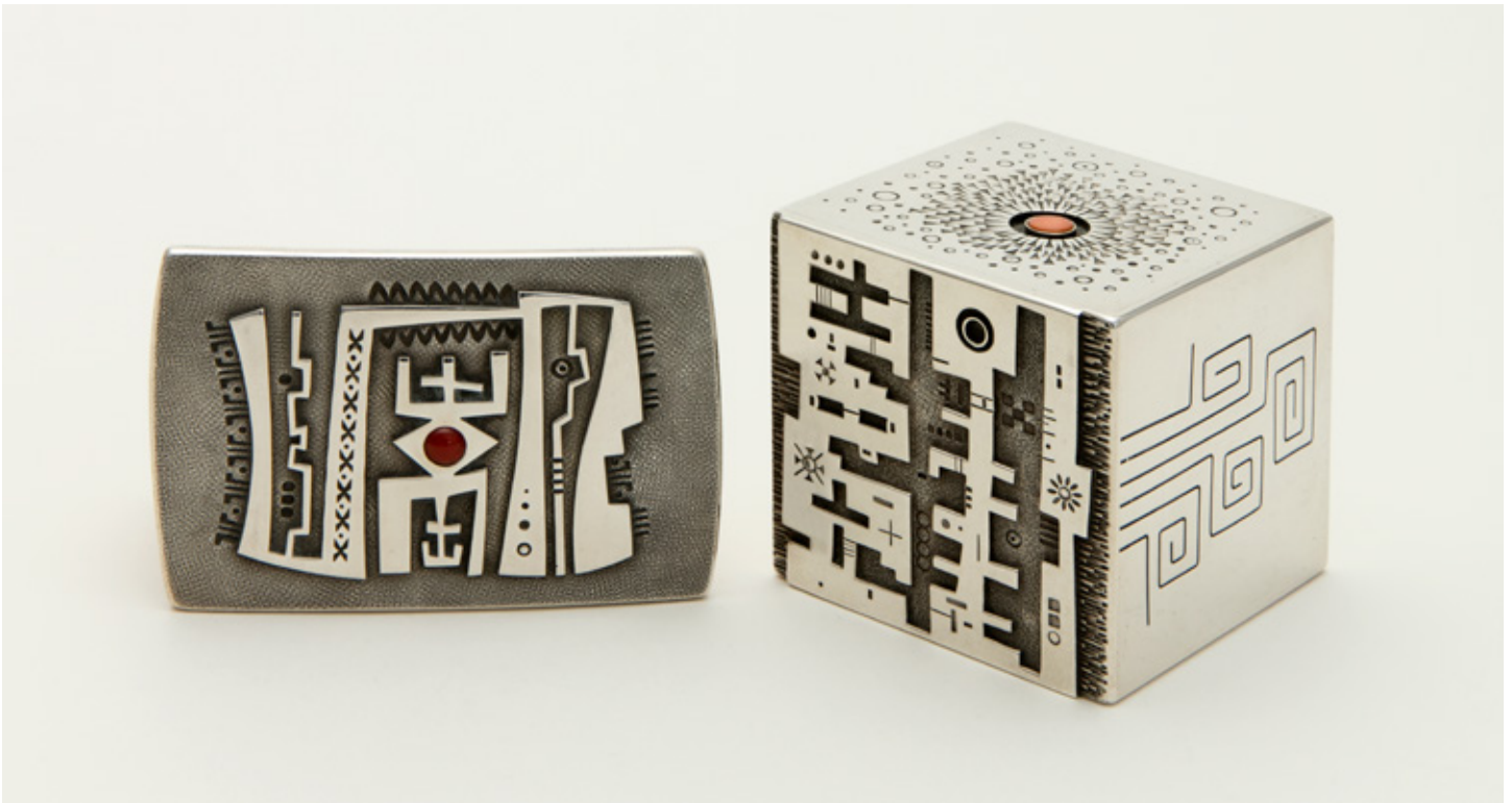
Left: Silver belt buckle with coral, c. 1994; W 2.75 inches. Wheelwright Museum, Gift of Nancy Florsheim.